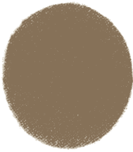
Homogeneous – no inner ring

The following simple test method is developed to assess the compatibility/ stability of different bunker fuels before mixing them in the same tank. Two samples are mixed together and heated up to 95 °C in the heating bath. One drop of this heated mixture is applied on chromatographic SPOT TEST paper. As soon as the formed spot dries out, the end-result can be directly analyzed: