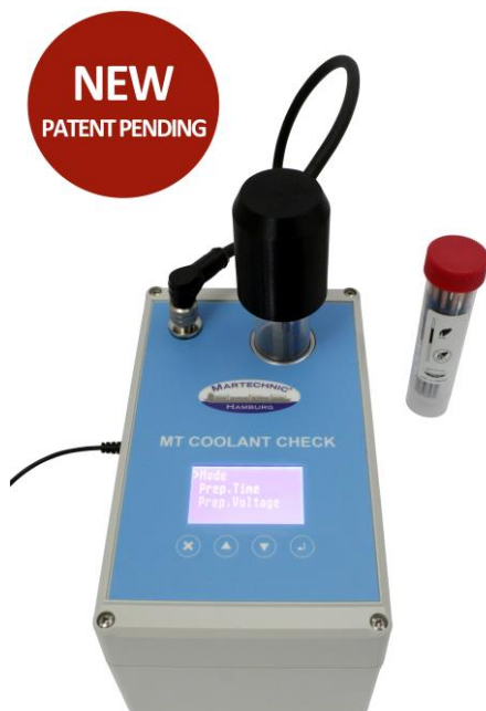
Test Device "MT COOLANT CHECK" with a Screw Cap Test Tube incl. Changeable (Corrosion-Prone) Electrodes, Set of 18 pcs, Steel